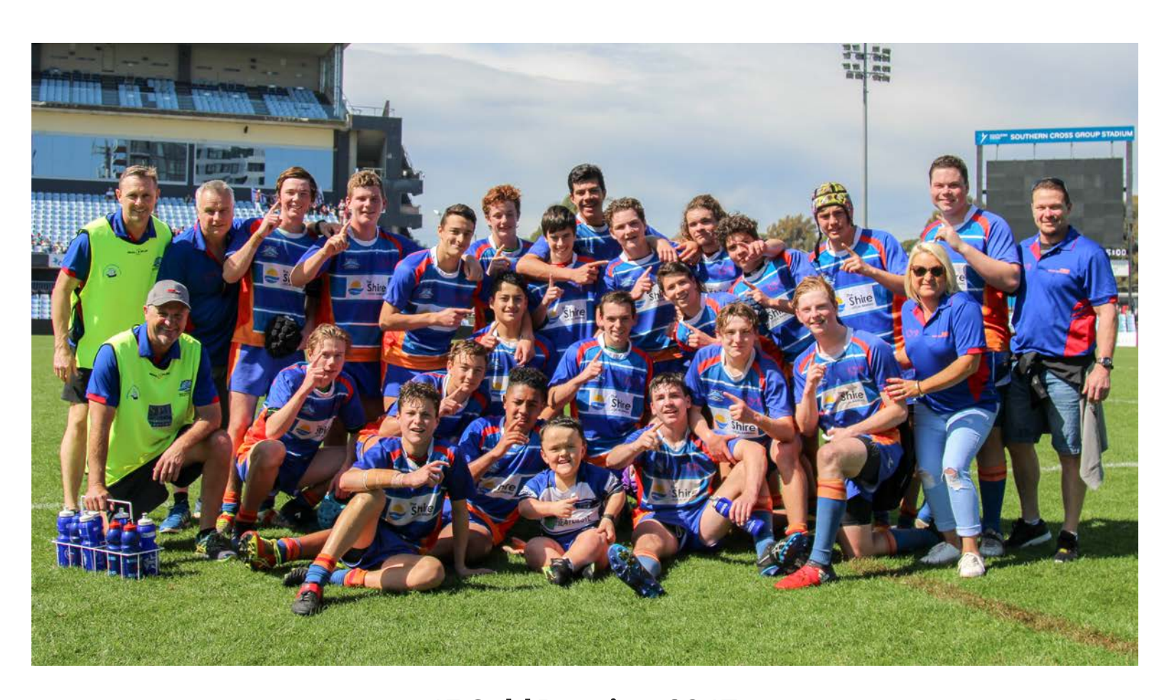
15 Gold Premiers 2017